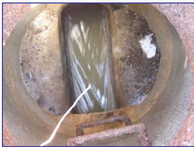
Design of the PS42 FM project started in November 2008.

This project includes the design and construction of the force main to convey flow from PS 42 FM to the South WWTP. Once complete, flows will be redirected within the Central Basin to the South WWTP and accommodate upgrades within the South Basin following completion of construction of the South WWTP.